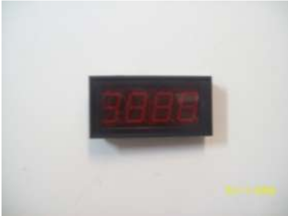
Amp meter LED 3.5 digital